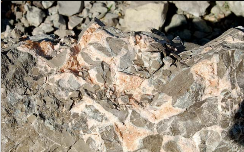
limestone with vug of dolomite