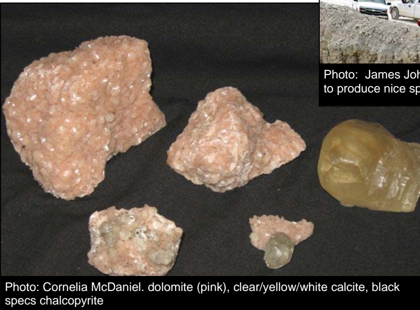
dolomite (pink), clear/yellow/white calcite, black specs chalcopyrite